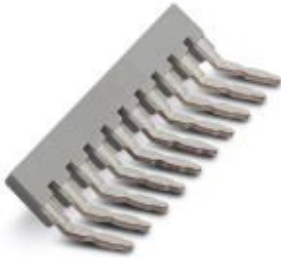
Insertion bridge, pitch: 6.2 mm, number of positions: 10, color: gray

Please be informed that the data shown in this PDF Document is generated from our Online Catalog. Please find the complete data in the user's documentation. Our General Terms of Use for Downloads are valid ( http://phoenixcontact.com/download )