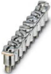
Fixed bridge, pitch: 4.2 mm, number of positions: 10, color: silver

Please be informed that the data shown in this PDF Document is generated from our Online Catalog. Please find the complete data in the user's documentation. Our General Terms of Use for Downloads are valid ( http://phoenixcontact.com/download )