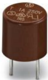
Replacement fuse, for INTERBUS-ST modules

Please be informed that the data shown in this PDF Document is generated from our Online Catalog. Please find the complete data in the user's documentation. Our General Terms of Use for Downloads are valid ( http://phoenixcontact.com/download )