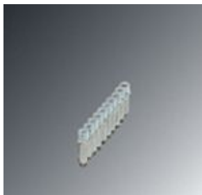
Fixed bridge, pitch: 5.2 mm, number of positions: 10, color: silver

Please be informed that the data shown in this PDF Document is generated from our Online Catalog. Please find the complete data in the user's documentation. Our General Terms of Use for Downloads are valid ( http://phoenixcontact.com/download )