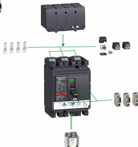
400 to 630A assembly