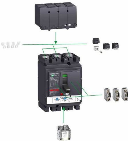
100 to 250A assembly

Compact NS and NSX Circuit breakers from 100 to 630 A