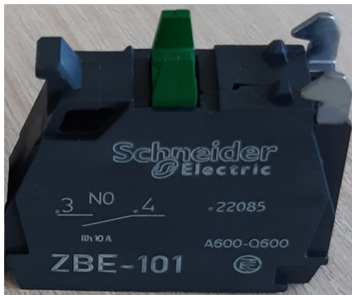
Current Product- existing green pusher