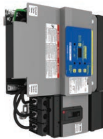
I-Line™ SurgeLogic™ SPD Unit