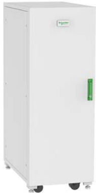
Modular Battery Cabinet

The Square D Easy UPS 3S is an easy-to-install, easy-to-use and easy-to-service 10-40 kVA 3-phase 208 V UPS ideal for non-IT applications. Easy UPS 3S combines power stability with robust electrical specifications and long-lasting performance to ensure your business continuity.