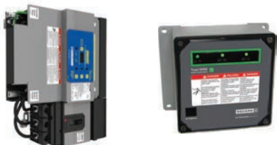
SurgeLogic™ Type IMA