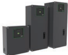
SurgeLogic™ Type EMA