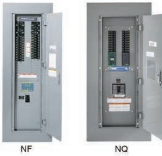
Panelboards Refer to Section 9