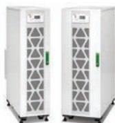
Easy UPS 3S