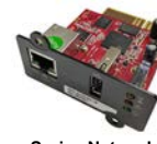
Series Network Card