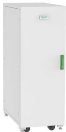
Modular Battery Cabinet