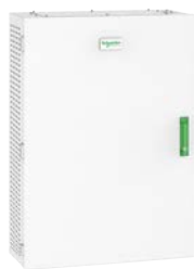
Maint Bypass Panel