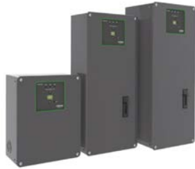
EMA Series SPDs