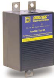
MA Replacement Module