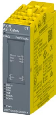
SIMATIC ET 200SP Safety communication module F-CM AS-Interface Safety ST for AS-Interface