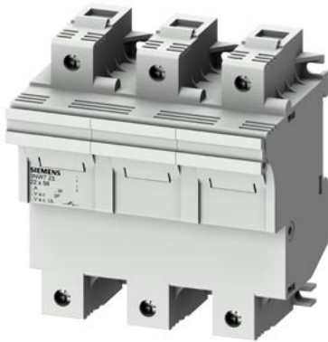
SENTRON, cylindrical fuse holder, 22x58 mm, 3-pole, In: 100 A, Un AC: 690 V