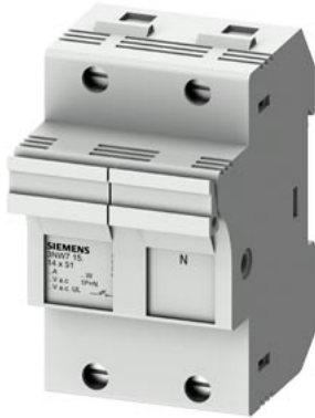
SENTRON, cylindrical fuse holder, 14x51 mm, 1P+N, In: 50 A, Un AC: 690 V