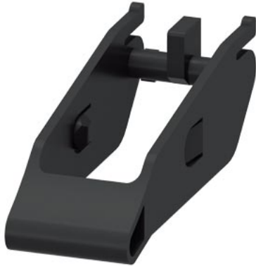
Fixing/reject bracket for plug-in relay RT series