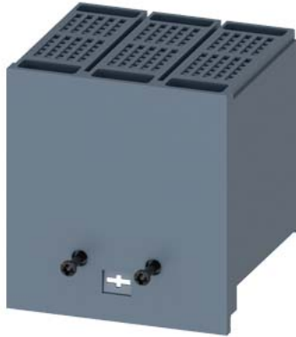
terminal cover extended 3-pole 1 unit accessory for: 3VA1 100/160