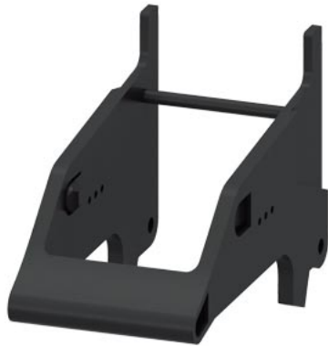
Fixing/reject bracket for plug-in relay RT series and PT screw terminals logical and PT spring-loaded terminal socket logical disconnection