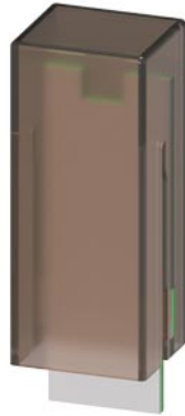
RC element, 24-48 V AC