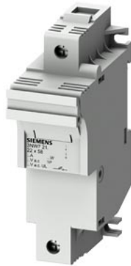
SENTRON, cylindrical fuse holder, 22x58 mm, 1-pole, In: 100 A, Un AC: 690 V