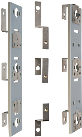
MZ00DSA MZ00ESAECO MZ01DSA